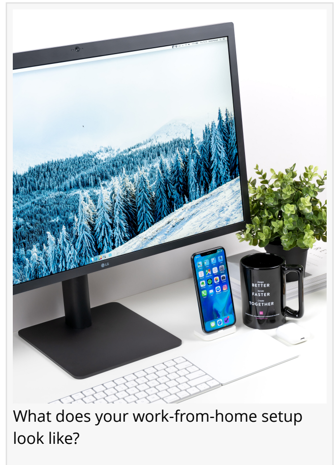
What does your work-from-home setup look like?

Find a Job with Your Individual Work Style with Rookieplay