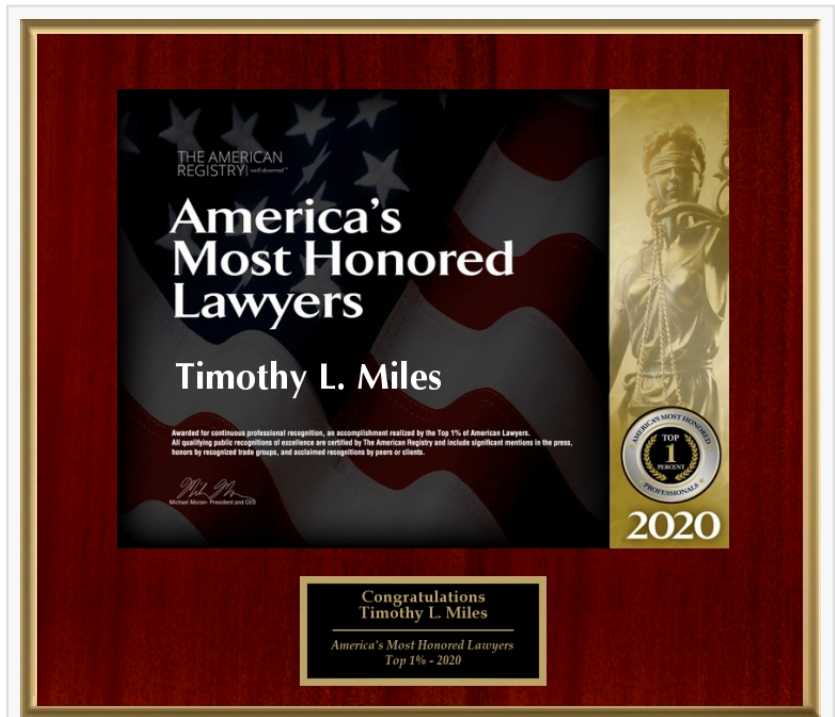
Nationally Recognized Shareholder Rights Attorney Timothy L. Miles Has Achieved the Recognition of American’s Most Honored Lawyers 2020 - Top 1%