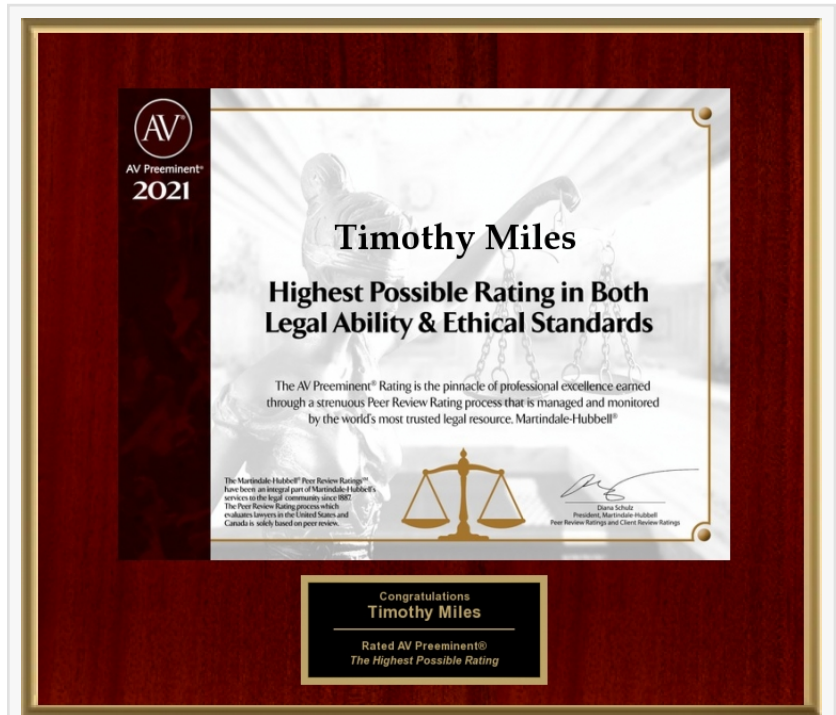
AV PREEMINENT 2021