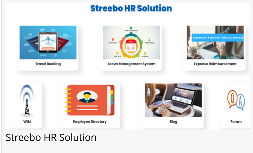
Streebo HR Solution