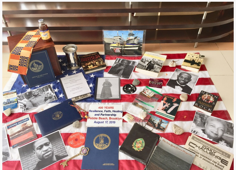
Time Capsule items