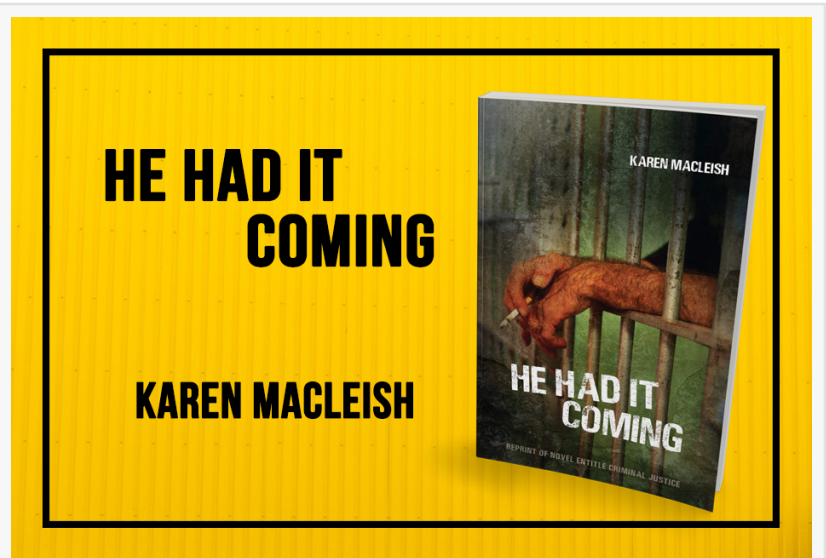
He Had It Coming