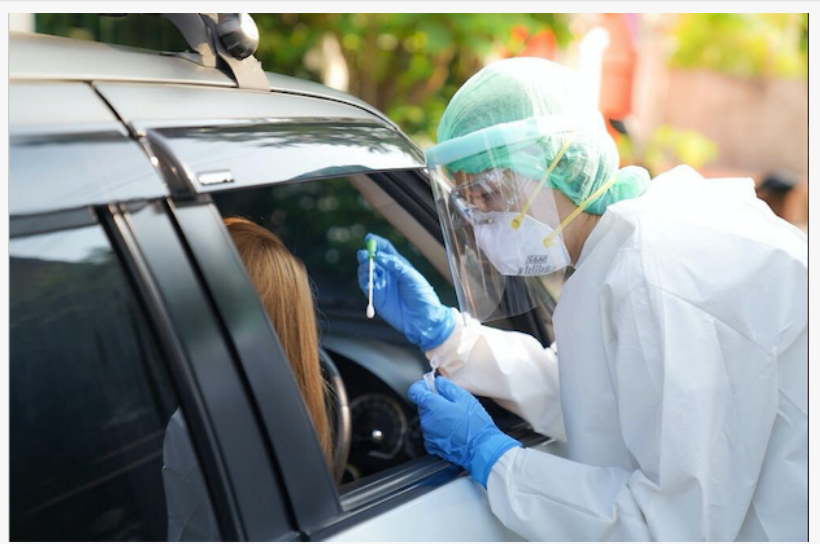
Drive up Rapid COVID Testing

Where: The Shops At Wailea, 3750 Wailea Alanui Drive, Wailea, HI 96753. Enter via the south gate. How: To be tested, drive to the parking lot, wait in your car for our staff to come to you. Bring: Valid I.D., Health Insurance Card, credit card for payment of $63. Next: Doctors On Call will call you with your results in approximately 15 minutes.