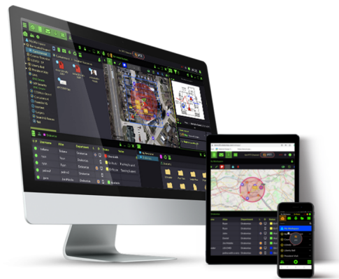
DragonForce Web Command Client also has the ability to PTT to Mobile Clients