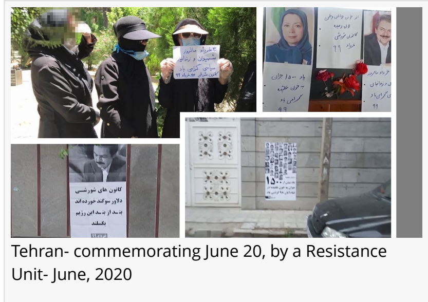
Tehran- commemorating June 20, by a Resistance Unit- June, 2020

During the past week, Resistance Units and supporters of the People's Mojahedin Organization of Iran (PMOI/MEK) marked June 20, 1981, the beginning of the Iranian people's Resistance against the ruling religious dictatorship, and the day of martyrs and political prisoners.