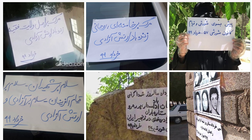
Tehran - A Resistance Unit calls for "protest and uprising"- June, 2020