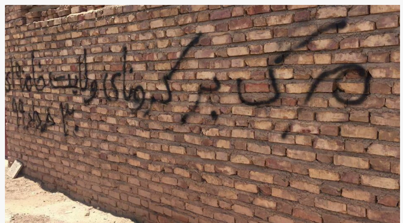
Kerman- "Down with the Mullah's rule, worse than the Coronavirus"- June, 2020