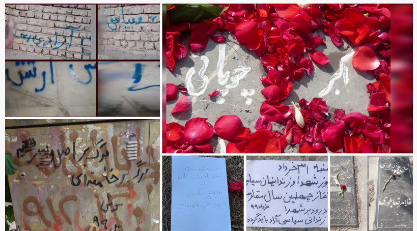
Activities of the Resistance Units and supporters of the MEK in various cities- June 2020