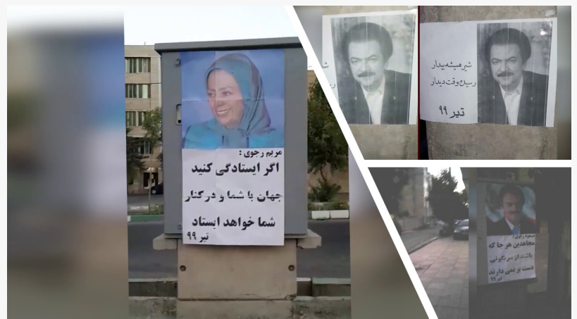
Karaj and Hashtpar (Gilan)- Installing banners of Iranian Resistance leaders-June 26, 2020