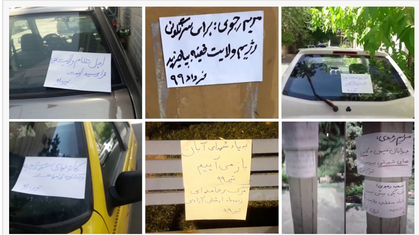
Tehran-Qom, let's rise up to overthrown the velayat-e Faqih regime – June, 2020

Shahin Gobadi NCRI +33 6 50 11 98 48 email us here Visit us on social media: Twitter