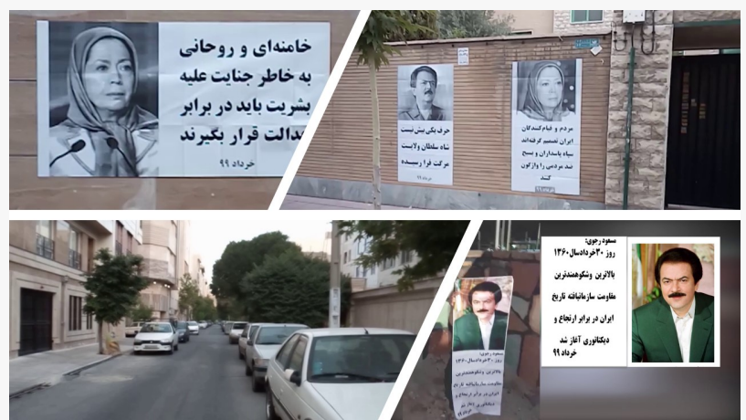
Tehran- "Maryam Rajavi Khamenei and Rouhani must be held accountable for crimes against humanity"- June , 2020

Among the slogans were "Maryam Rajavi: June 20, is the turning point in the historic resistance for freedom and democracy and against Iran's religious dictatorship," "Maryam Rajavi: Let's remember 1,500 fallen victims during November 2019 uprising," "Marking June 20, the day of the martyrs and political prisoners," "June 20 marks the day of the martyrs, your path continues," "Khamenei's headquarters is the source of all diseases, terrorism, torture, looting and corruption," "We can and we must overthrow the velayat-e faqih regime (religious dictatorship)," "Down with Khamenei, Rouhani, Long live the Liberation Army," "Hail the martyrs, to rebellions, to freedom fighters and to the army of freedom." "Long live the memory of the martyrs of last November's uprising," "Hail to those who stood up to the dictatorship and did not surrender," "Massoud Rajavi: From June 20, 1981, until today, Resistance was waged for the freedom of our people and our homeland," "Down with Khamenei, hail to Rajavi," "Democracy, freedom with Maryam Rajavi."