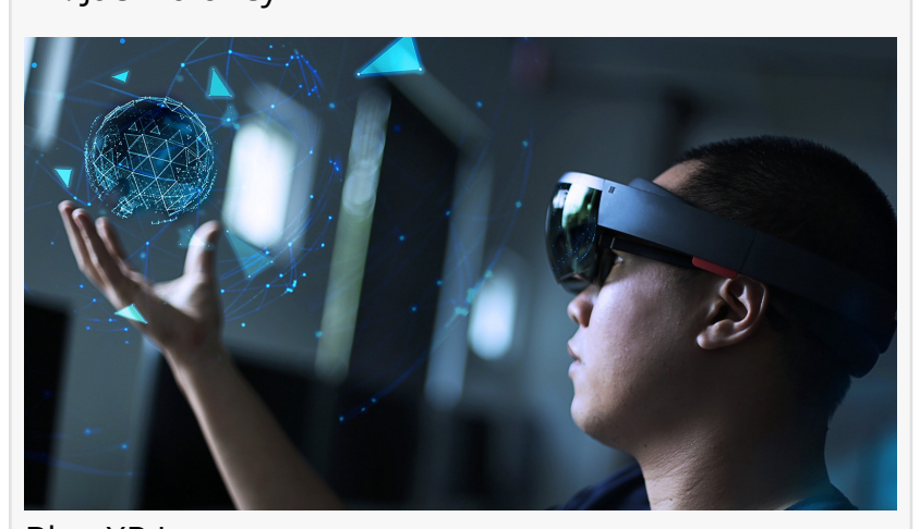
Blue XR Image

(NWOL). According to figures released in May, online Education is expected to quadruple in size within the near future. The budget and investments regarding XR technologies from the