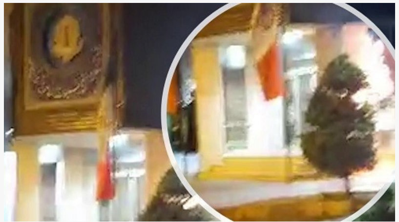
Rasht- Torching Khamenei's banner- June 2020