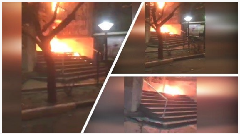
Semnan- Repressive Basij Center - June 2020