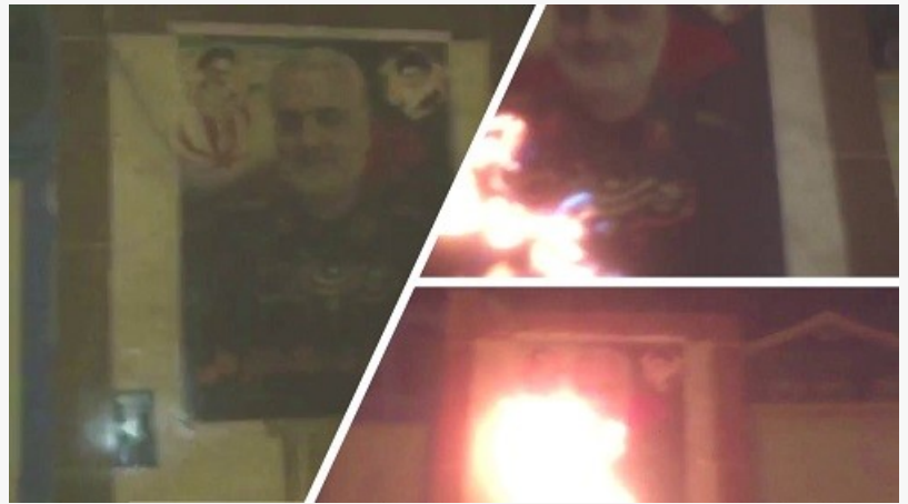
Behbahan- Torching Qassem Soleimani, commander of the terrorist Quds force- June 2020