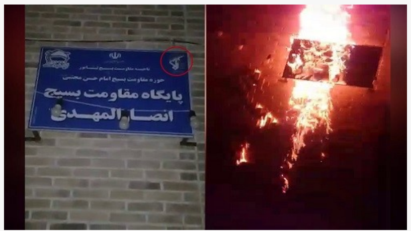
Neyshabur- Repressive Basij center-June 19, 2020