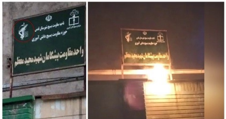
Tehran (Qods township)- Repressive Basij center- June 2020