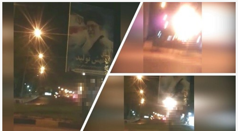
Andimeshk- Torching Khamenei's bill-board- June 2020

This press release can be viewed online at: https://www.einpresswire.com/article/520361595 EIN Presswire's priority is source transparency. We do not allow opaque clients, and our editors try to be careful about weeding out false and misleading content. As a user, if you see something