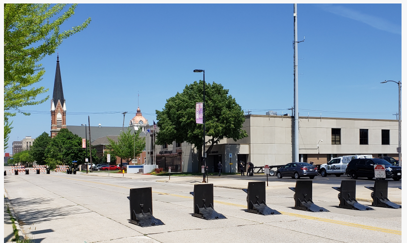
Meridian barriers are staged ahead of Black Lives Matter protest in Green Bay

This press release can be viewed online at: https://www.einpresswire.com/article/519138995