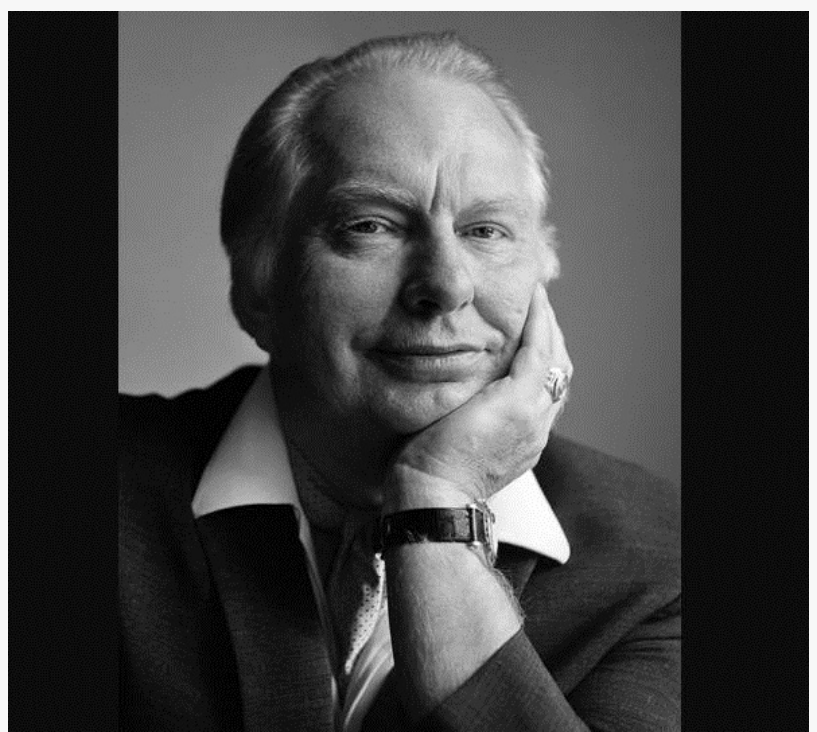
L. Ron Hubbard, author and humanitarian

Now available in 50 languages, the demand for Dianetics: The Modern Science of Mental Health continues unabated, with more than 22 million copies sold in 176 countries.