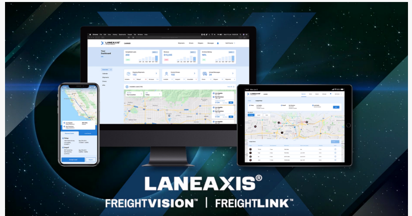
LaneAxis FreightVISION™ and FreightLINK™