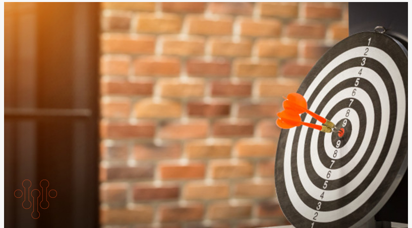
Playpal's Algorithm Deepens