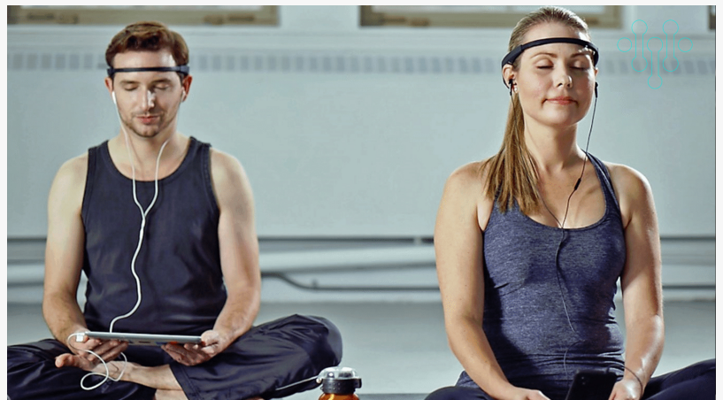
Playpal Future Integrations