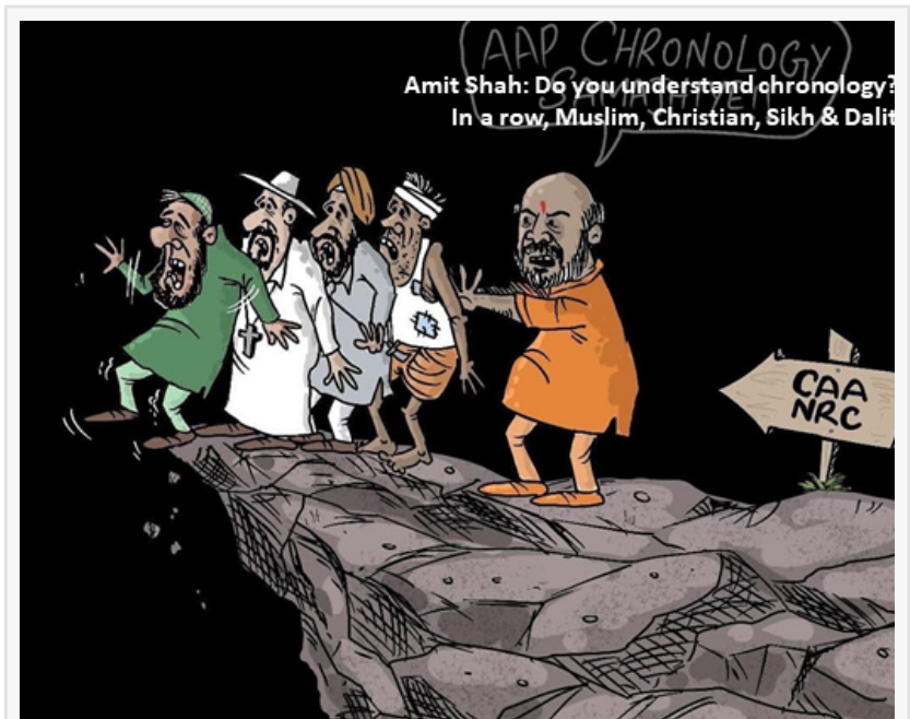
Cartoon depicts Martin Niemoller poem - Muslims, Christians, Sikhs, Dalits