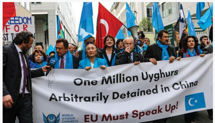
A Million Uyghurs detained by Chinese - gross injustice