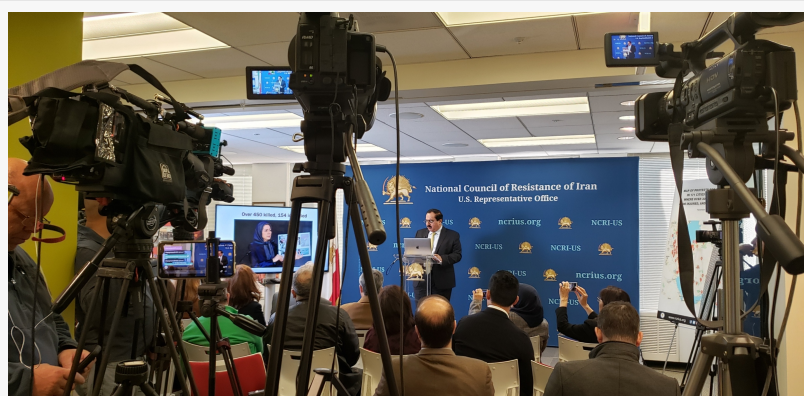
Media attended NCRI Washington office on Nov 26, 2019 for Iran uprising press conference

WASHINGTON, DC, US, November 28, 2019 /EINPresswire.com/ -- On Tuesday, November 26, 2019, the US representative office of the National Council of Resistance of Iran ( NCRI-US ) held a press conference in Washington, coinciding with its release of a 60-page report on the uprising seeking regime change in Iran, which began on November 15.