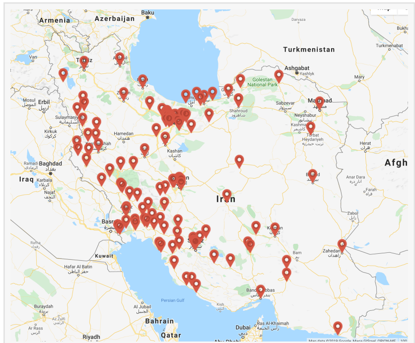
Map of Iran showing 171 cities where protest took place against the Iranian regime in November 2019

Alireza Jafarzadeh NCRI-US +1 202-747-7847 email us here