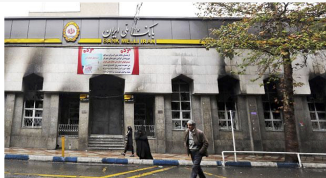
Bank Melli, Iran's largest bank with 3,325 branches designated as terrorist (SDGT) by U.S. Treasury was protesters' key target