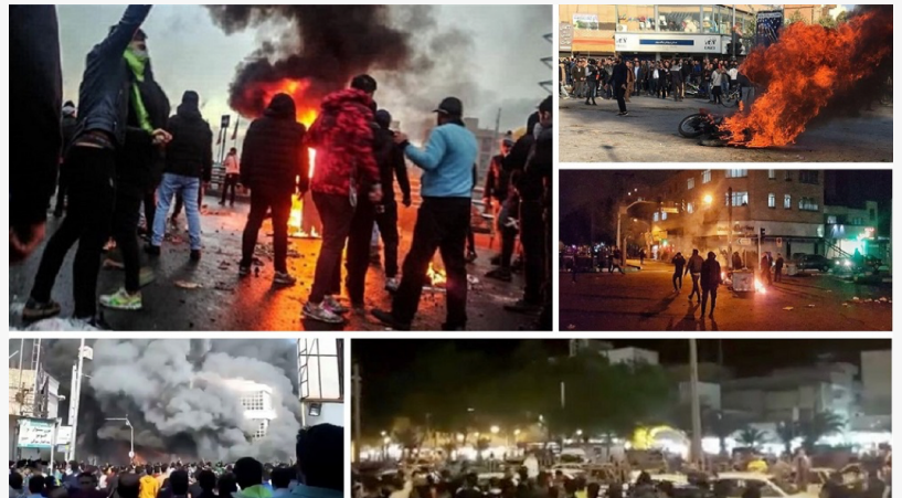
Protests in November 2019 was far more serious than the 2009 and 2018 uprising as people called for the end to the religious dictatorship in Iran