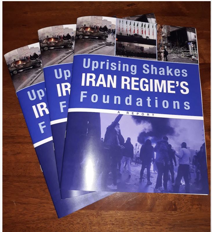
NCRIUS released a 60-page report, Uprising Shakes Iran Regime's Foundations