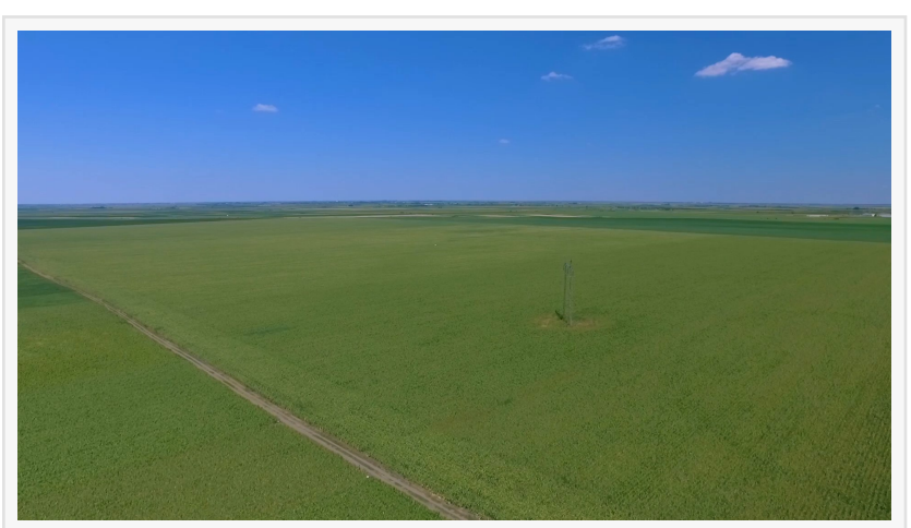
AGRICULTURE LAND; The farm consists of agriculture land of approximately 1.400 ha, of which 434 ha are owned, 952 ha are rented on most fertile ground in region

As the World Organization for Animal Health warns, the disease has triggered a global crisis and a quarter of the pig population is dying of African