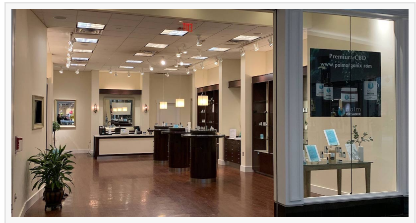
CBD Oil Wholesale Washington DC

WEST NYACK, NEW YORK, UNITED STATES, October 4, 2019 /EINPresswire.com/ -- West Nyack, New York: <u>Palm Organix™</u>, a leader in the sale of premium, broad spectrum CBD Oil products today announced the launch of their <u>wholesale partnership</u> program for Health and Wellness practitioners looking to offer their clients and customers premium, safe,