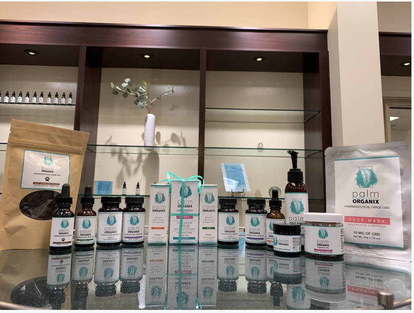
Wholesale CBD Products in Washington DC

our products knowing that they will receive all the benefits of Broad Spectrum CBD without any of the negative psychoactive side effects associated with THC."