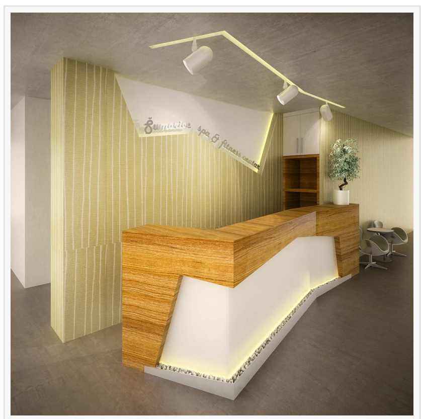
Buy CBD Oil Wholesale in Washington DC

Softgels: We offer a variety of softgel options, including our regular CBD