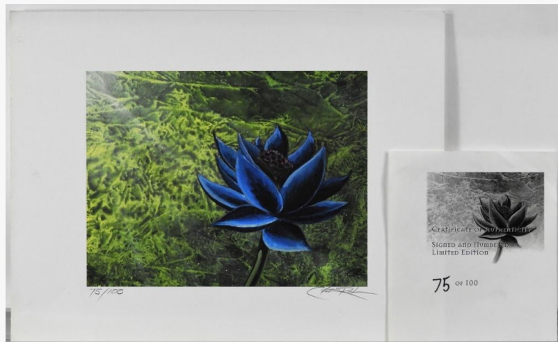
Original, limited-edition lithograph of the iconic Magic: The Gathering Black Lotus trading card artwork, signed and numbered "75/100" by illustrator Christopher Rush (est.$3,000-$5,000).

This press release can be viewed online at: http://www.einpresswire.com