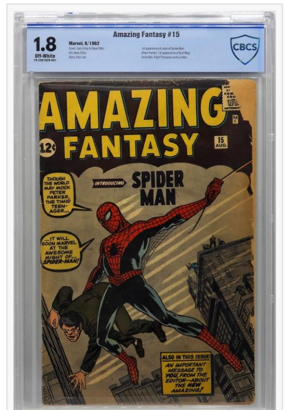
Copy of Marvel Comics Amazing Fantasy #15 (Aug. 1962), graded CBCS 1.8, featuring the first appearance and origin of Spider-Man as well as other primary characters (est. $7,000-$10,000).