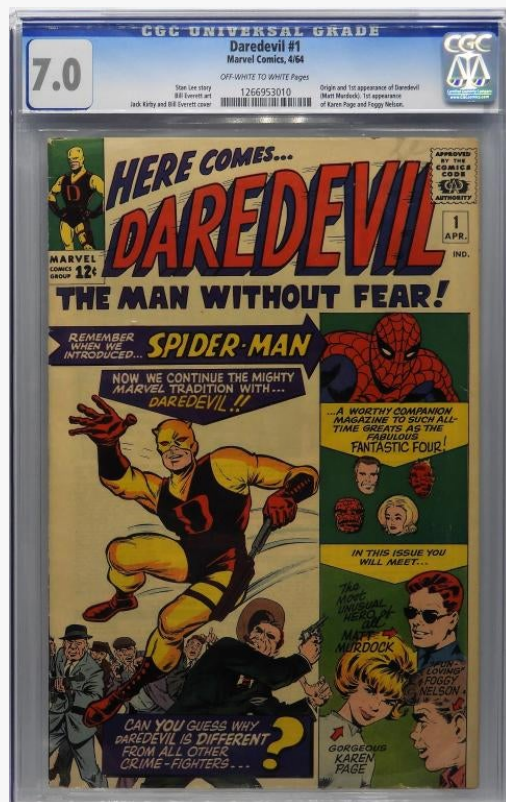
Copy of Marvel Comics Daredevil #1 (April 1964), featuring the origin and first appearance of Daredevil and the first appearance of Karen Page and Foggy Nelson (est. $3,000-$4,000).