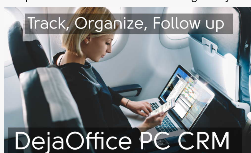
DejaOffice PC CRM - Keep your data securely out of the cloud even while you fly!