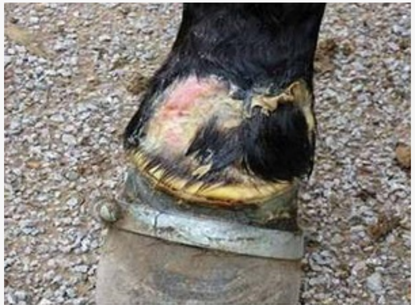
Example of soring that enforcement of the Horse Protection Act would prevent