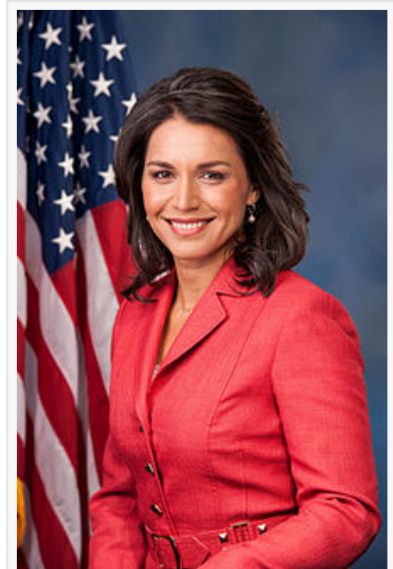
U.S. Rep. Tulsi Gabbard

The PAST Act seeks to strengthen the Horse Protection Act and end the torturous, painful practice of soring Tennessee Walking, Racking, and Spotted Saddle Horses. Soring, the intentional infliction of pain to horses' front limbs by applying caustic chemicals such as mustard oil or kerosene or inserting sharp objects into the horses' hooves to create an exaggerated gait known as the "Big Lick," has plagued the equine world for six decades.