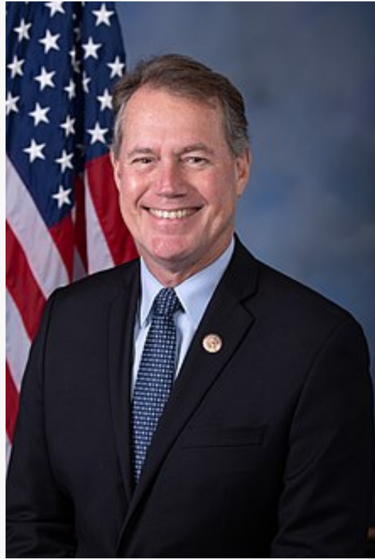
U.S. Rep. Ed Case

The PAST Act has been blocked for years by a handful of well-placed lawmakers, but a new