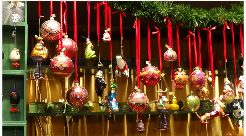
Frankfurt Christmas Market Stall

This press release can be viewed online at: http://www.einpresswire.com