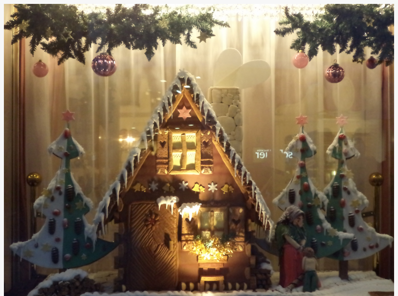
Christmas Window in Linz

Christmas markets were first held in Germany, but these days, you can find them not only in Europe but also in many countries all over the world.