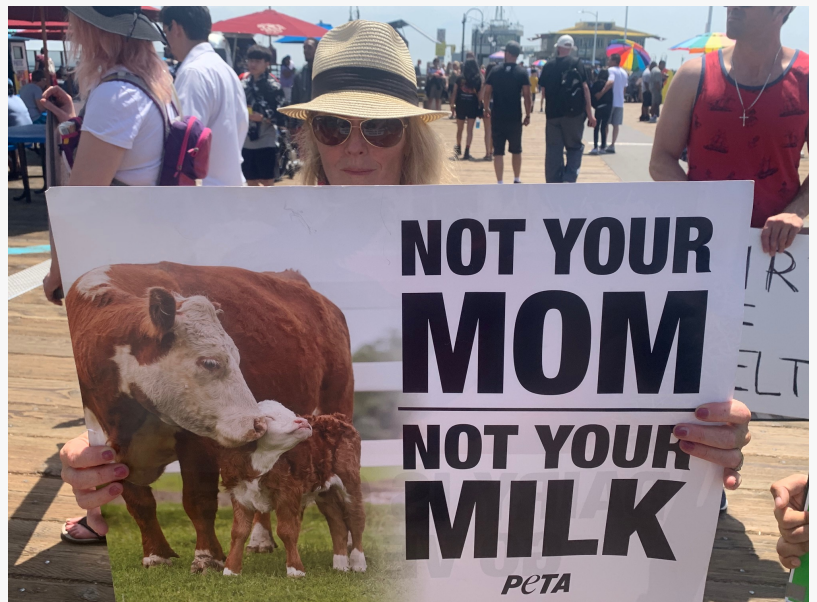
Protesters Say Dairy is Inherently Cruel Because Mothers and Babies are Separated