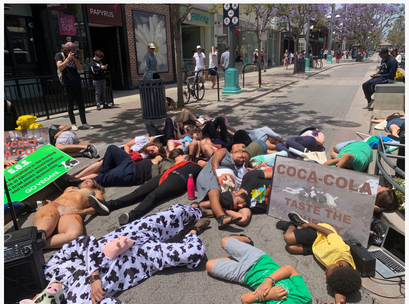
Protesters Symbolically Reenact Dead Piles of Calves