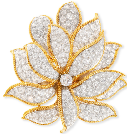
Fine jewelry will be led by pieces from iconic American jeweler David Webb, including a bold diamond and platinum foliate brooch (est. $10,000-15,000).