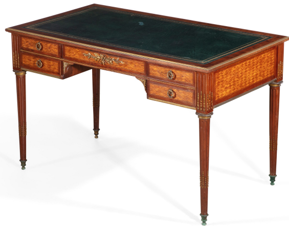
Fine Louis XVI style gilt bronze mounted plum pudding mahogany and marquetry bureau plat by François Linke (Paris, circa 1900) (est. $4,000-6,000).

An oil on copper scene of a Gothic cathedral Johann Ludwig Ernst Morganstern (German, 1738-1819) has a pre-sale estimate of $10,000-15,000 and will highlight the centuries of fine art in the sale. Three Robert Graham figural bronze sculptures and reliefs, including Gabrielle, 1998 (est. $4,000-6,000) as well as British Modernist paintings by Frank Beanland (est. $1,000-1,500) and