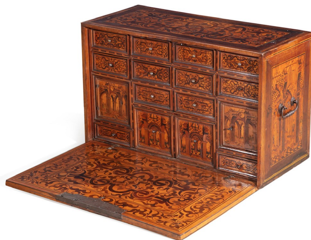
Fine late 17th century German late Renaissance marquetry inlaid walnut table cabinet, probably Augsburg or Nuremberg (est. $15,000-20,000).

This press release can be viewed online at: http://www.einpresswire.com