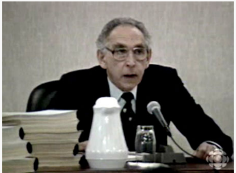
Judge Krever delivered a scathing indictment of Government Blood oversight

This press release can be viewed online at: http://www.einpresswire.com