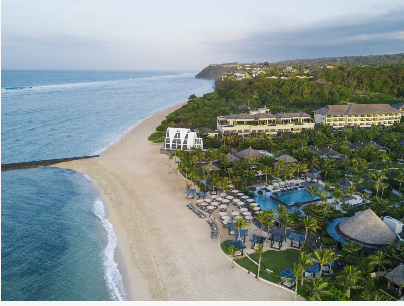
The Ritz-Carlton, Bali launches a tantalizing new menu for its Gourmet Sunday Brunch by the Beach

This press release can be viewed online at: http://www.einpresswire.com