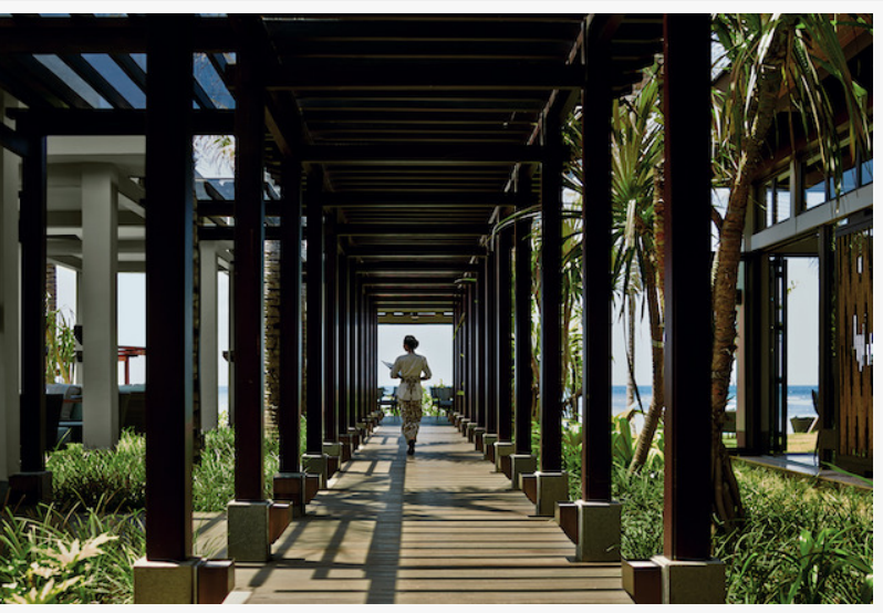
The Beach Grill Restaurant is perfectly positioned for Gourmet Sunday Brunch

About The Ritz-Carlton, Bali. Located on a stunning beachfront combining with a dramatic clifftop setting, The Ritz-Carlton, Bali is a luxurious resort offering an elegant tropical ambience. Featuring tranguil views over the azure waters of the Indian Ocean the resort has 279 spacious suites and 34 expansive best villas in Bali, providing the sheerest of contemporary Balinese luxury. Along the foreshore are The Ritz-Carlton Club<sup>®</sup>, six stylish dining venues, an indulgent and exotic marineinspired Spa, and fun, recreational activities for children of all ages at Ritz Kids. A glamorous beachfront