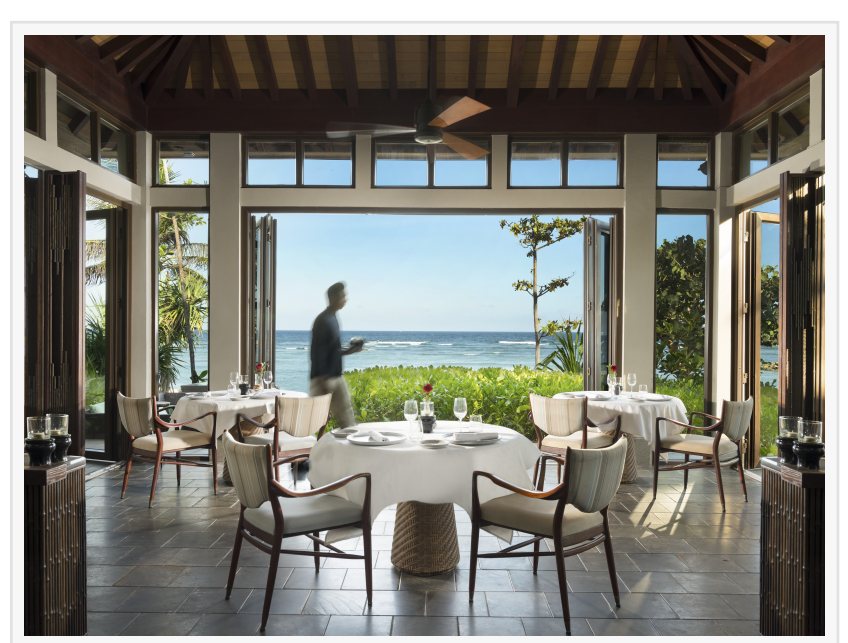
A beachfront restaurant, stunning ocean views and a gentle sea breeze.

"As one of the best hotel in Bali we are blessed with a beachfront location, stunning ocean views and a gentle sea breeze. The Beach Grill Restaurant is perfectly positioned for Gourmet Sunday Brunch menu that focuses on