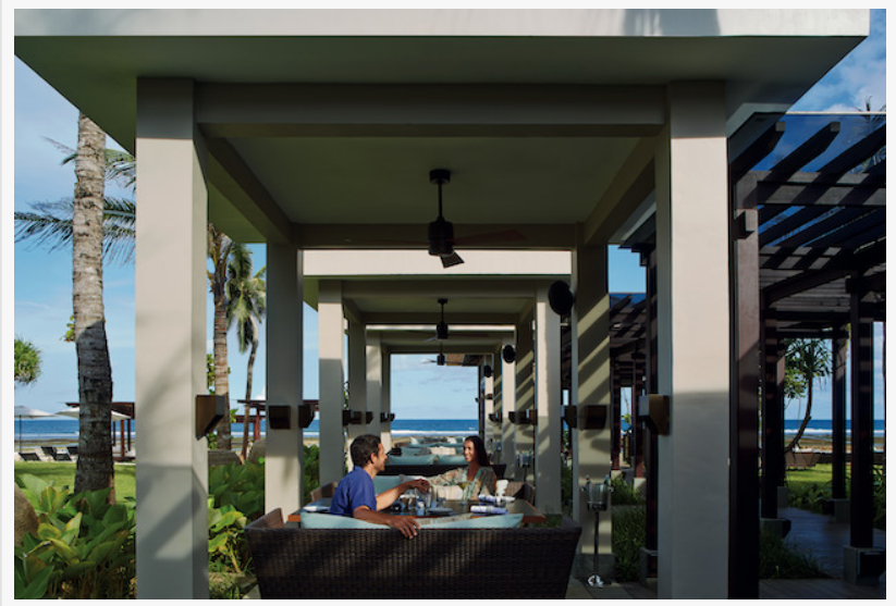
The Beach Grill highlights the island's freshest ingredients

wedding chapel, makes an idyllic setting for destination weddings, while a range of outdoor event venues and extravagant spaces provide the perfect scene for celebratory events and wedding reception in Bali. Well-appointed conference venues, luxurious meeting spaces, customizable residential packages and experienced organizers also entice those looking to create inspired MICE Tourism events in Bali. Whether work, pleasure or romance is on the agenda, The Ritz-Carlton, Bali is the place to make memories that last a lifetime. Follow us on Facebook, Instagram, Twitter, Youtube, LinkedIn. Google+, WeChat.