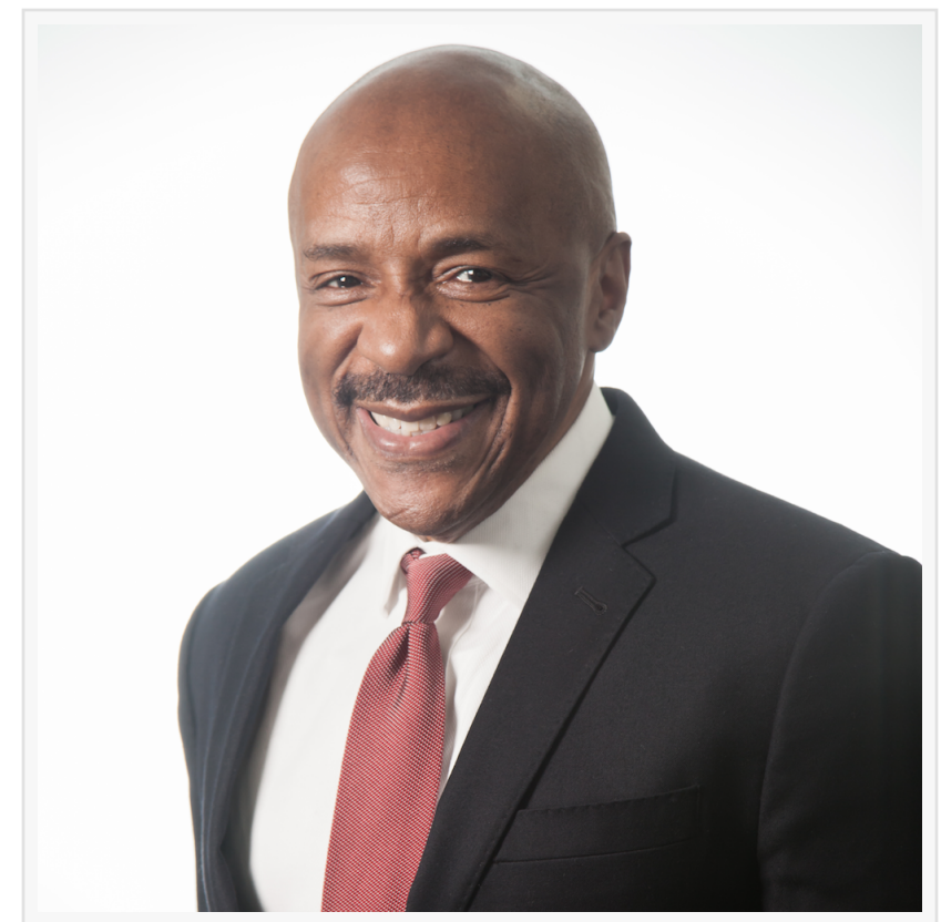
SVP, Education & Diversity Solutions, NAMIC