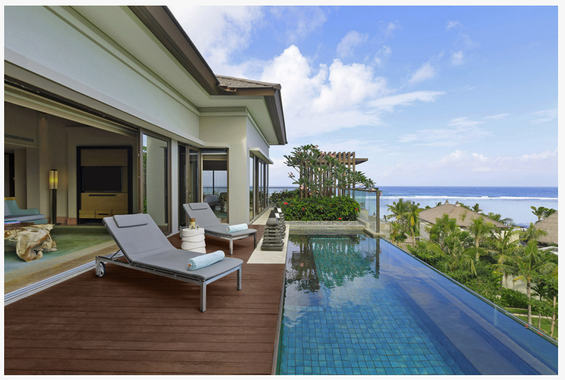
Celebrate the most special day of your life in our Sky Villa