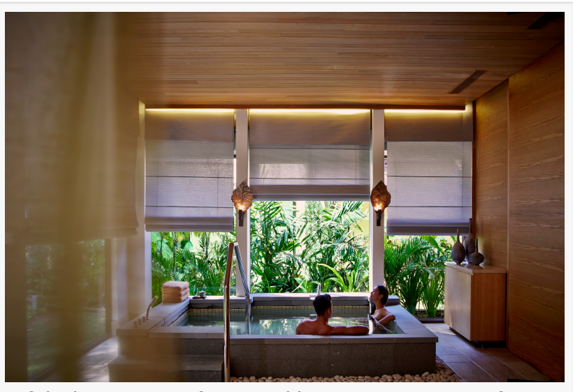
A fabulous array of spa and beauty treatments for couples

Those with an intimate ceremony in mind can elevate their ceremony, literally, with an exclusive <u>Sky Wedding</u>, An inspired option for up to eight guests, our fabulously-appointed Sky <u>Villas</u> have a top floor location and exquisite panorama, so you can exchange vows with bird's eye views over the sparkling Indian Ocean.