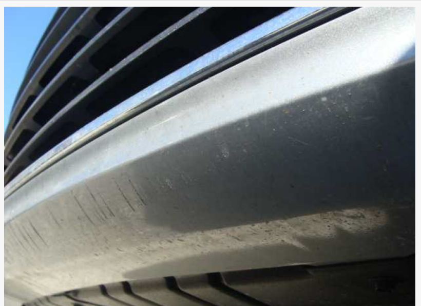
'Damage' according to sworn testimony of EHI manager; directly and profoundly contradicted by company publicly touted protocols (FTC and CFPB alerted)