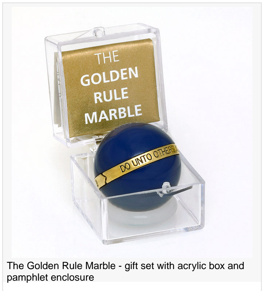
The Golden Rule Marble - gift set with acrylic box and pamphlet enclosure

What is "The Golden Rule Marble™?" It is a unique, pocket-sized keepsake, consisting of the inspirational message of "The Golden Rule" inscribed on a brass ring wrapped around a high-quality, colorful acrylic marble. Translucent colors give the appearance of "light coming from within." This 1960's concept (plastic back then) has been re-designed, re-engineered and is now manufactured as a high-quality promotional giveaway.