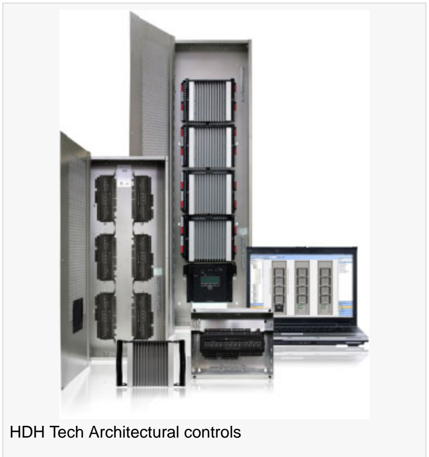
HDH Tech Architectural controls