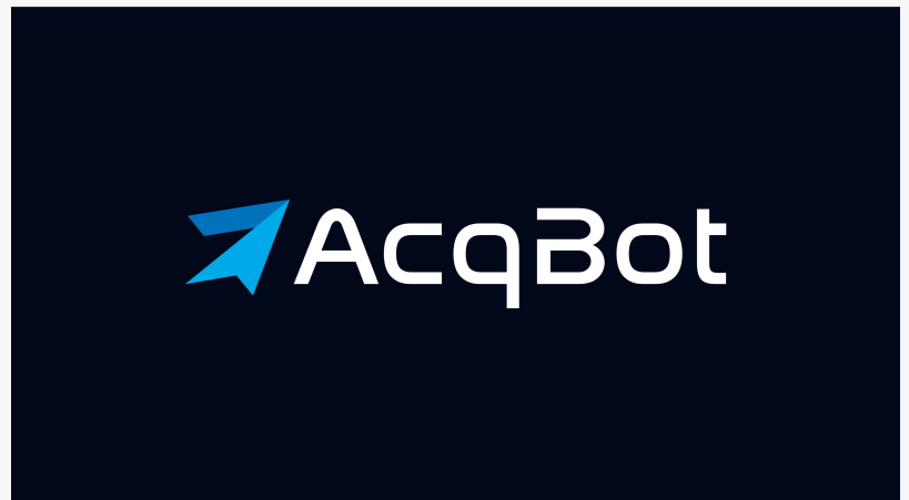
AcqBot Primary Logo

If you want to accelerate your acquisition processes, log in to AcqBot.mil today.