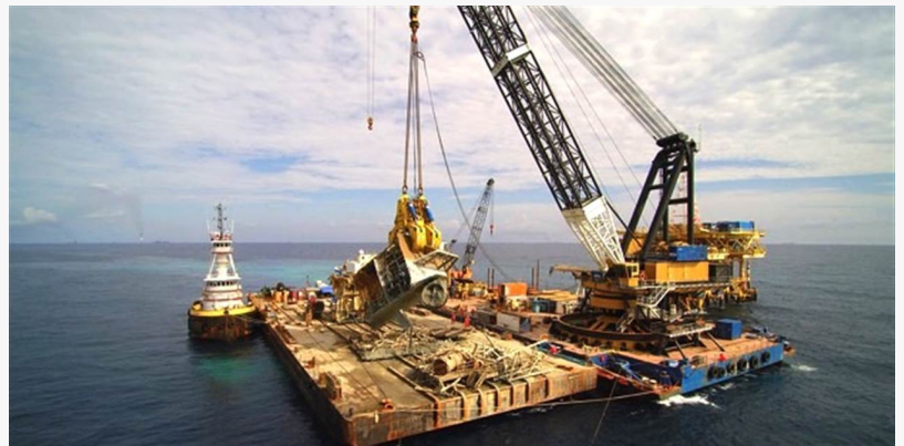
2026 Salvage Kit, 500 ft Salvage Barge, 1400 Ton Crane, 1000 Ton Grab - The Right Tools