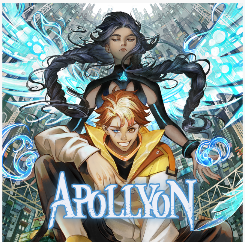
Apollyon Cover Art