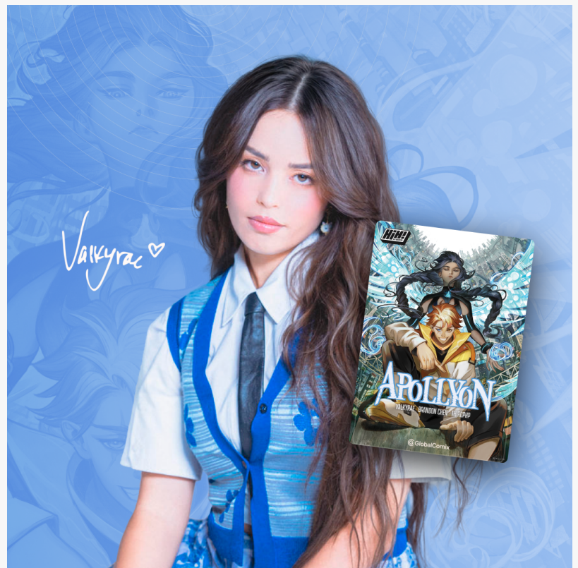
Valkyrae's Apollyon launches September 10, 2025

NEW YORK, NY, UNITED STATES, August 21, 2025 /EINPresswire.com/ -- GlobalComix today announced the next chapter in its mission to become the premier destination for manga and comics worldwide, with a three-part expansion that includes the preview of its first-ever original manga series, Apollyon, developed with Valkyrae's HiHi Studios; the arrival of Kodansha's acclaimed library; the U.S./English launch of Kodansha's Young Magazine; and special discounts on the manga featured in the premiere edition of Kodansha's Young Magazine.