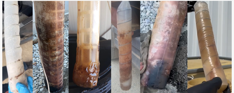
DQTube product performance (customer photos)

operation has developed a new smaller-profile, lower-priced iteration of their breakthrough DQTube Pro . DQTube Universal will fit millions of more tanks than DQTube Pro as it has a diameter of 3.5cm and a length of 20cm to fit into tanks with openings as small as 1.5-inches;