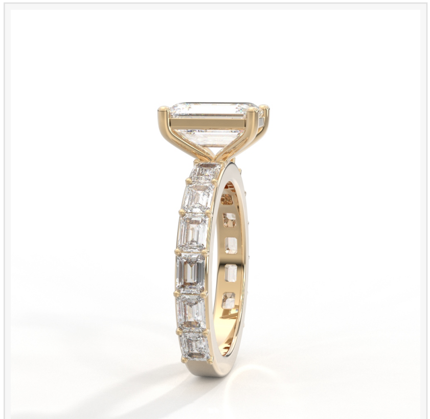
The Jewelers Coin & Loan Co. side perspective view crafting a 4ct emerald-cut diamond ring in 18k yellow gold with petite claw prongs

"Creating the perfect engagement ring is more than just choosing a diamond—it's about celebrating a shared vision. Communication is key with your significant other," says Venice. "Ask questions—lots of them. Discuss preferences about color, design style, shapes, engraving, metal types, and how the ring complements other jewelry already owned. Explore favorite brands, design inspirations, and lifestyle considerations together. Make it fun—try on different styles, share photos, and let your personalities shine through. The more open the conversation, the more meaningful and personal the final creation becomes. After all, designing an engagement ring should be an exciting and joyful experience that reflects your story as a couple."