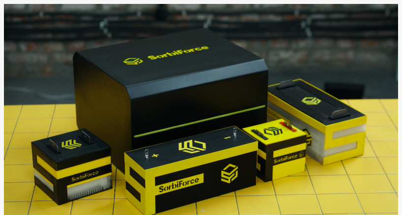
SorbiForce line up of safe sustainable batteries