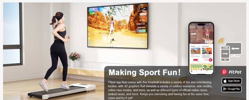
DeerRun & PitPat