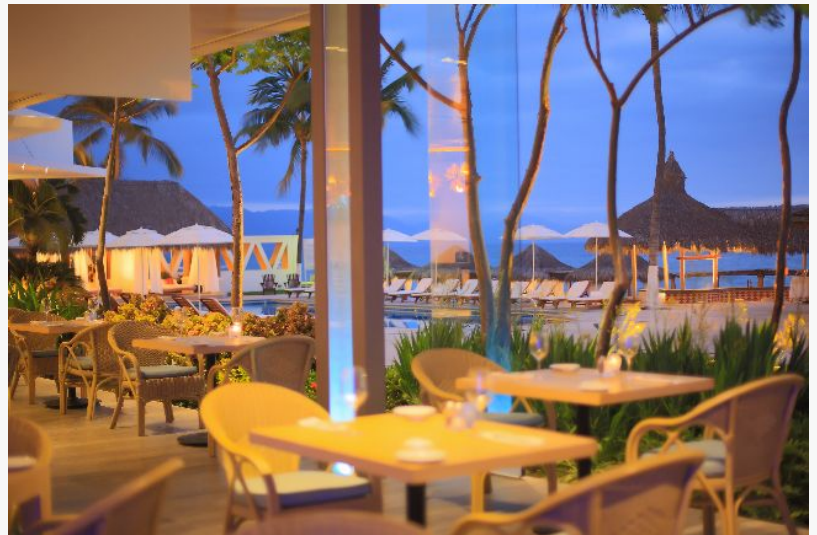
Villa Premiere Puerto Vallarta Raicilla Experience

Easily accessed from the adults-only 4 Diamond property, of the Villa Premiere Boutique Hotel & Romantic Getaway , this soft luxury property is beachfront on Banderas Bay, at the entrance to the city's historic downtown, the property is close to both great shopping and exciting nightlife;