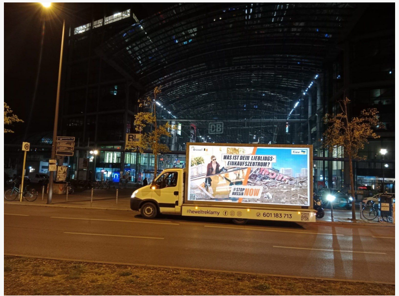
#StopRussiaNOW billboard around Europe

WROCLAW, LOWER SILESIA, POLAND, May 12, 2022 /EINPresswire.com/ -- BGK, a Polish development bank, launched a Europe-wide information campaign to remind people that the war in Ukraine continues. More than 1.73 million emails were sent to political leaders calling for radical measures #stoprussiaNOW .