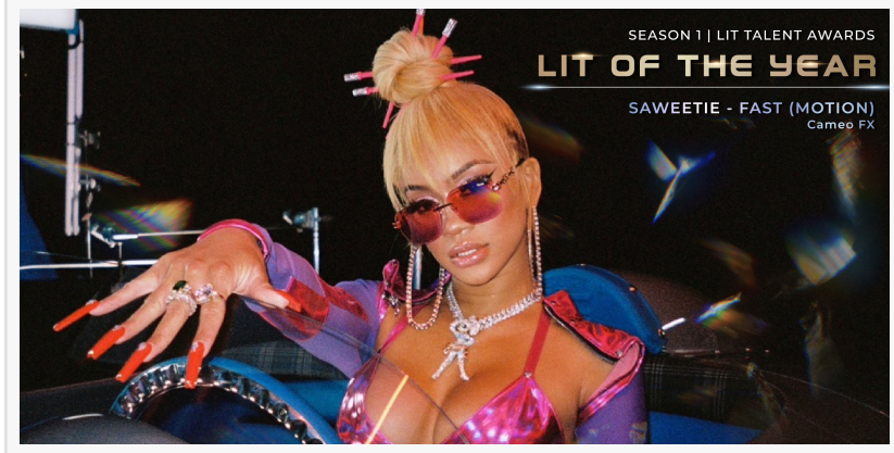
2022 LIT Talent Awards LIT of the Year

2022 Category Winners of the Year Asides the LIT Winner of the Year, the best of each available category were also chosen as the Category Winners of