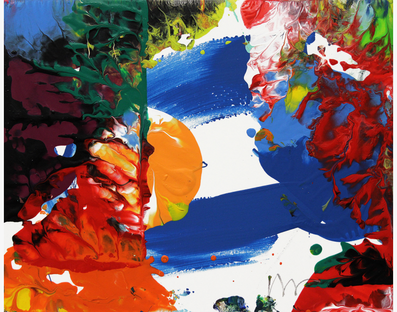
Cluffalo 345, 2020, latex on expanded PVC, 8 x 10 inches

That's not just talk: Clough is including his original, signed painting, along with the expected JPEG, in each NFT. He is selling them "in unity" and wishes them to stay that way – the "film" and the "ghost".