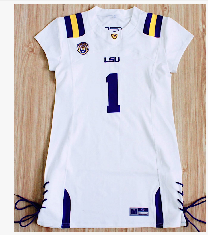
The Patented FERGO Authentic Official Collegiate Dress

Among a multitude of other items, FERGO is also preparing to launch a highly versatile Performance Maskshirt which has an integrated mask that is unobtrusive when not in use, and when it is, it looks sleek and is clearly designed for performance. When Covid finally and hopefully becomes a distant memory, the Performance Mask-shirt will continue to provide functional and great looking protection from many elements or for intensified training. The range of applications for this design reaches far beyond sports and athletics.