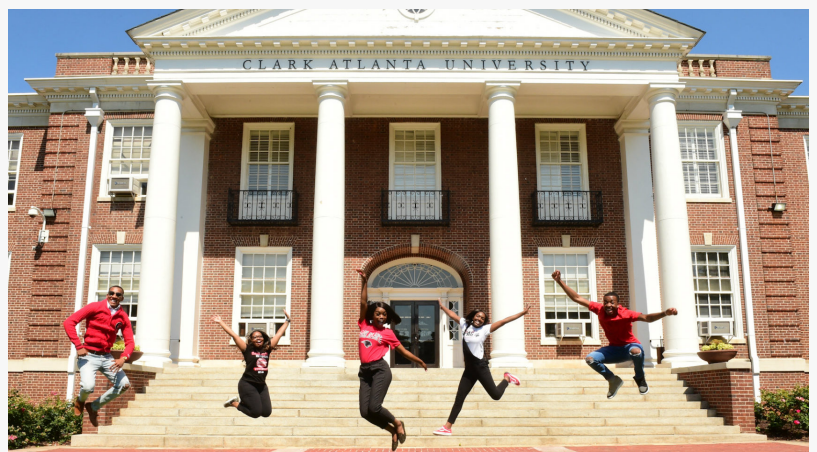
The Driving Force Internship program at Clark Atlanta University

(TDF), founding members of the Black Automotive Media Group (BAMG) recruited 15 scholars to participate in the 10-week, virtual, field-credit internship, which incorporates mentoring sessions, writing classes, video production, and media courses.