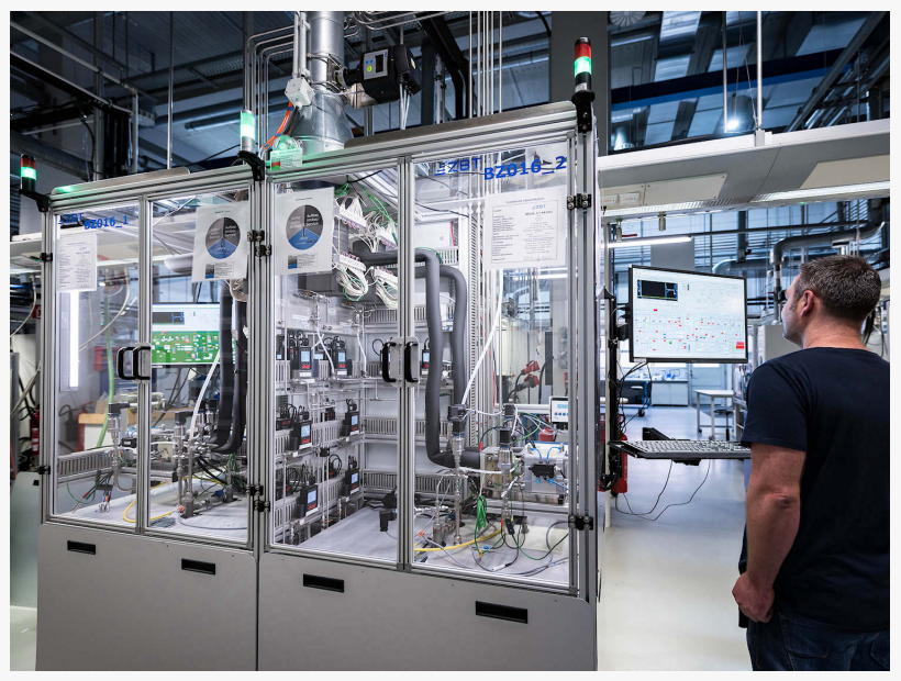
Two fuel cell test stations at the ZBT main laboratory

The measurements make it possible to get an insight into the processes inside the fuel cell. They answer the question of how the processes are distributed with which dynamics within the fuel cell. This is of crucial importance, for example, to avoid local undersupply in dynamic operation or to optimize the operating conditions in a focused manner. If the computer model can be validated with the data, the reliability of the predictions of the model increases in general. As a result, development and optimization processes can increasingly be carried out virtually, which promises a major