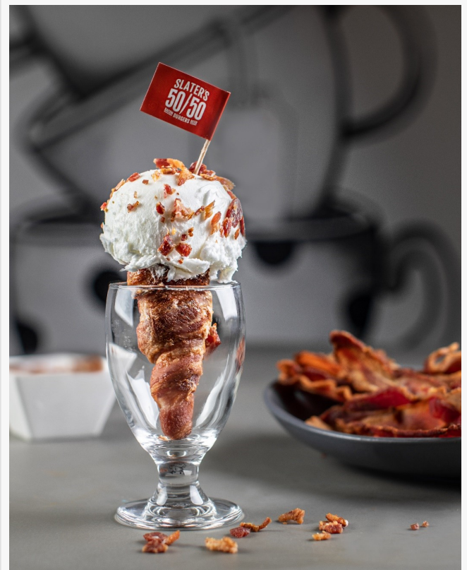
Bacon Ice Cream on a BaCONE