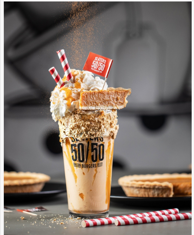
Pumpkin Pie Milkshake