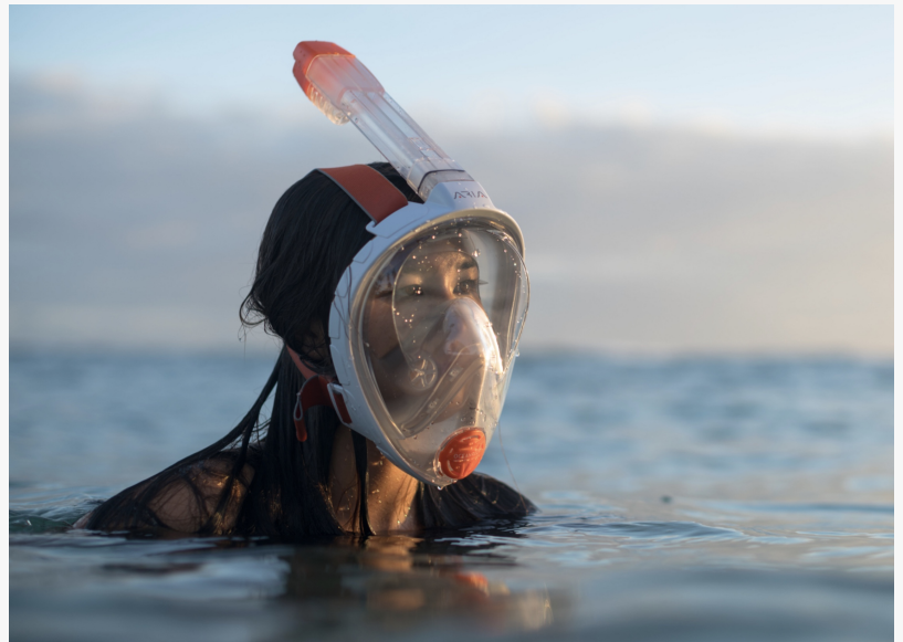
A Full Face Snorkel Mask

Aria full face snorkel masks, manufactured in Italy, remain the highest quality full face snorkeling masks on the market and ensure proper air exchange for snorkelers of all ages.