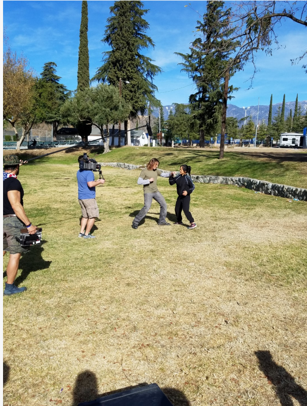
Behind the Scenes of Tango Down - Photo by Van Booth

This press release can be viewed online at: http://www.einpresswire.com