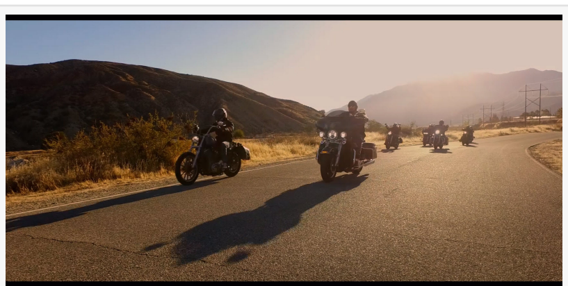
Tango Down Still