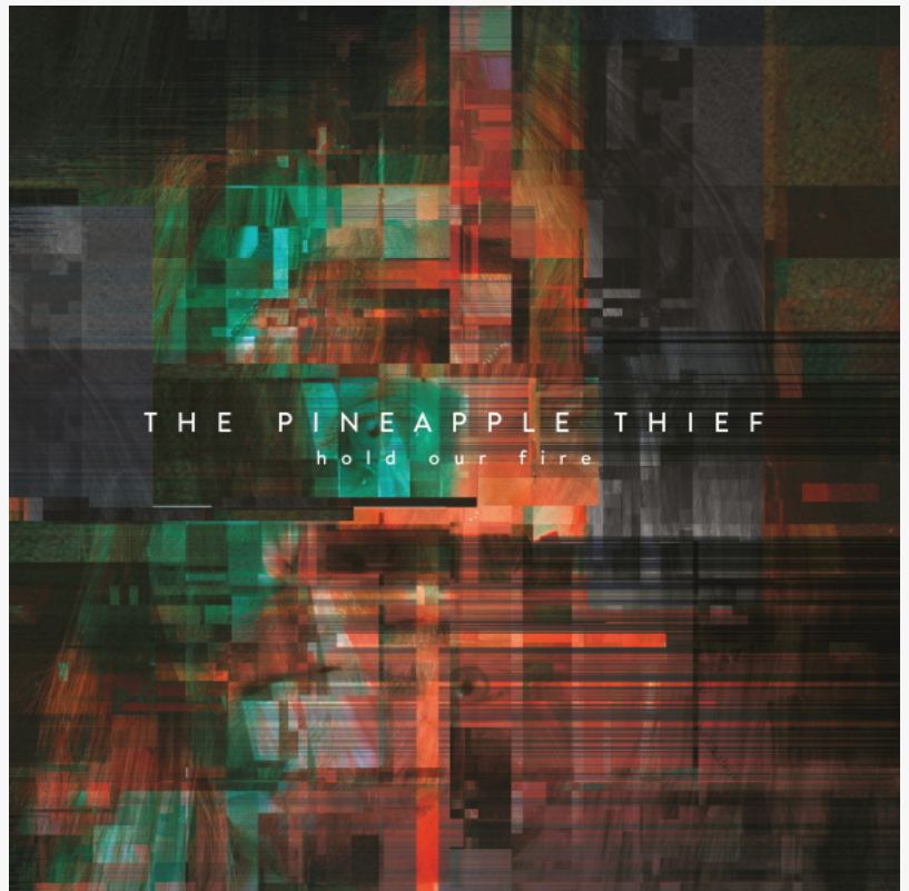
The Pineapple Thief - Hold Our Fire