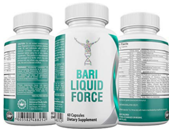
Bariatric Liquid Force Multivitamin

This press release can be viewed online at: http://www.einpresswire.com